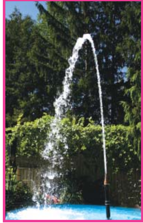
PEM 874B to 5.1m - 17 Ft, on 4" Elbow with PEM 21040 Flow Straightener